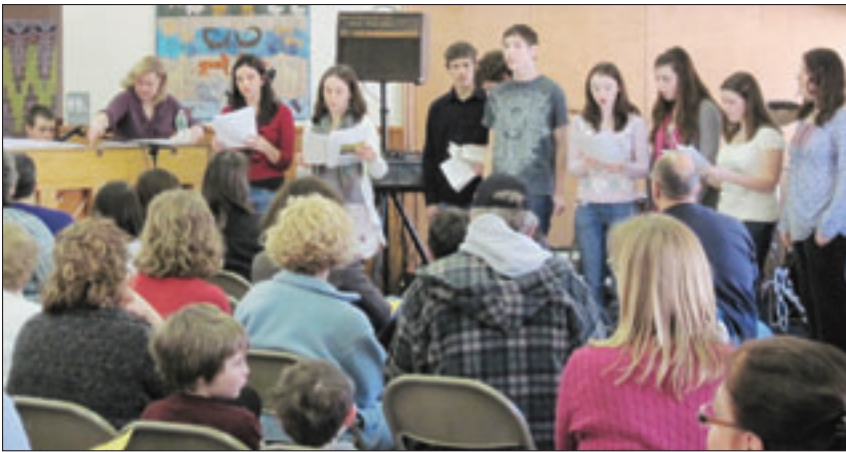
The Warwick Valley High School 2013 Chorus performs during a benefit concert for Haiti relief.